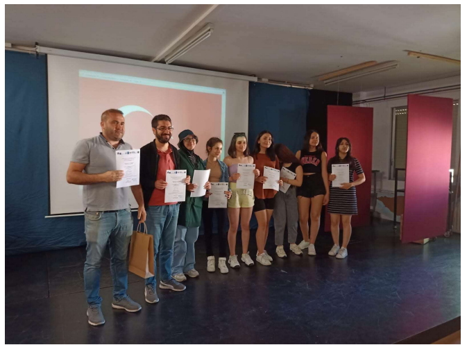
All the very enjoyable and educational project activities will be remembered for a long time and friendships which were made during the week will remain in the participants' lives.