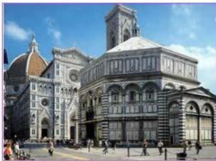
DUOMO OF FLORENCE