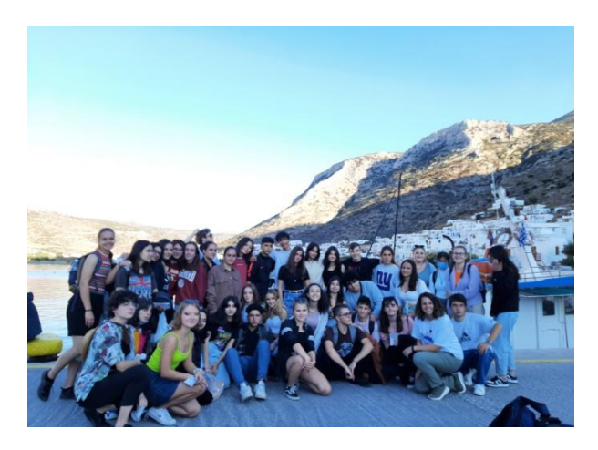
Thank you!